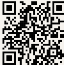
Pok Oi CM Services